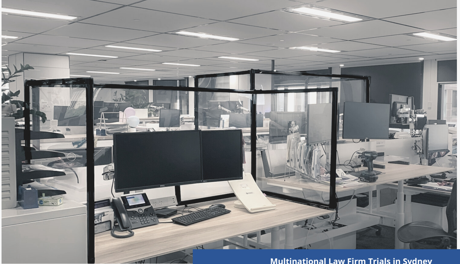
Multinational Law Firm Trials in Sydney