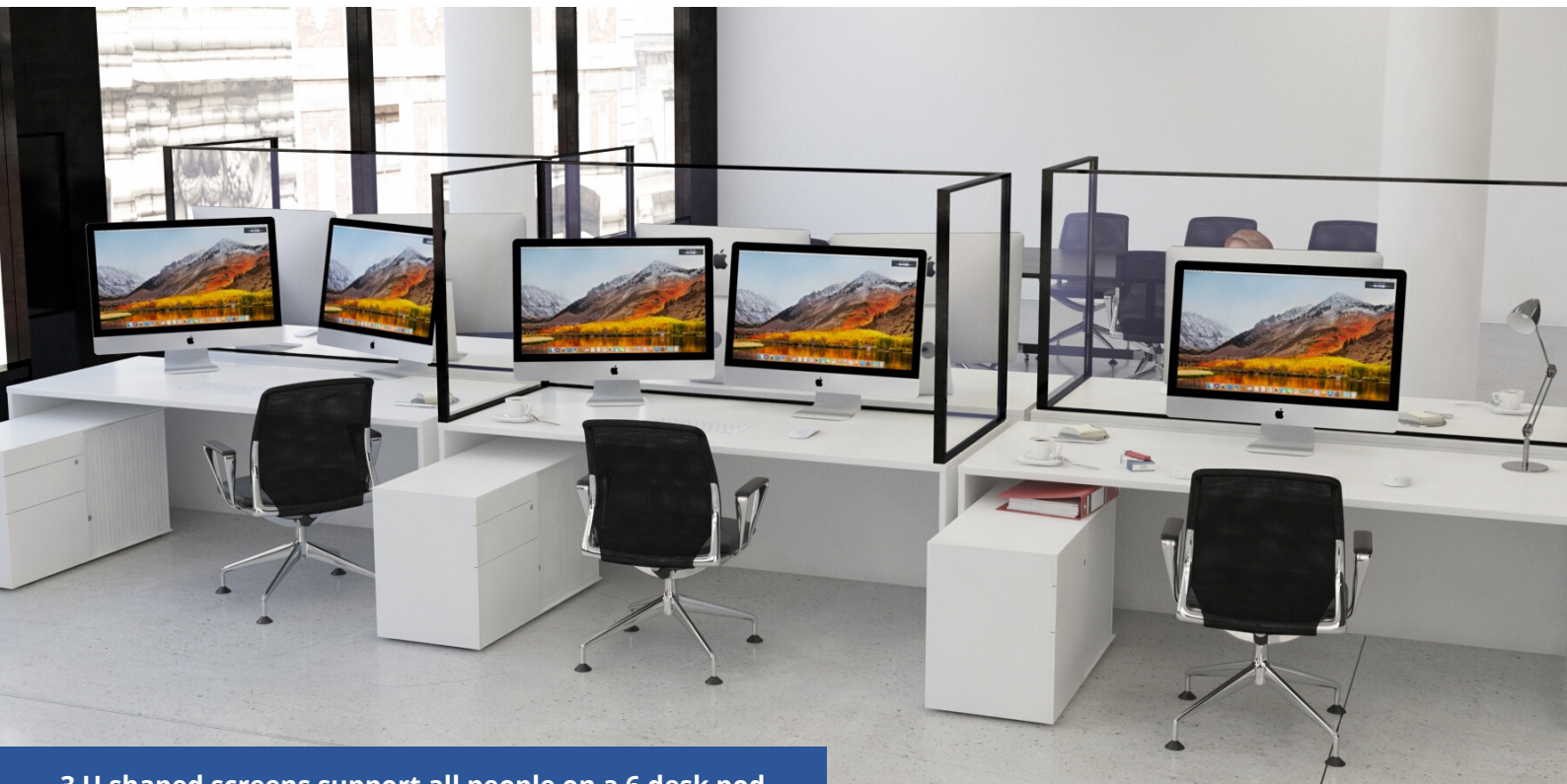
3 U shaped screens support all people on a 6 desk pod