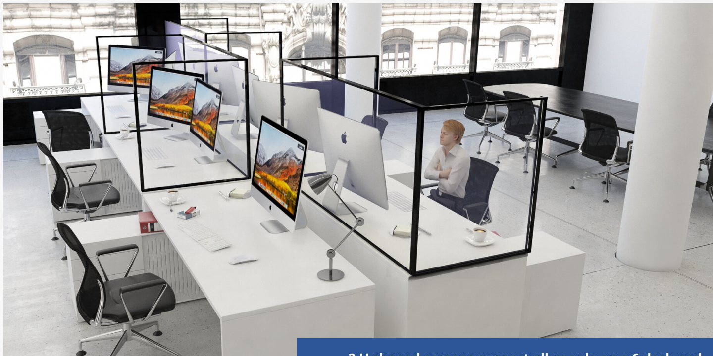
3 U shaped screens support all people on a 6 desk pod