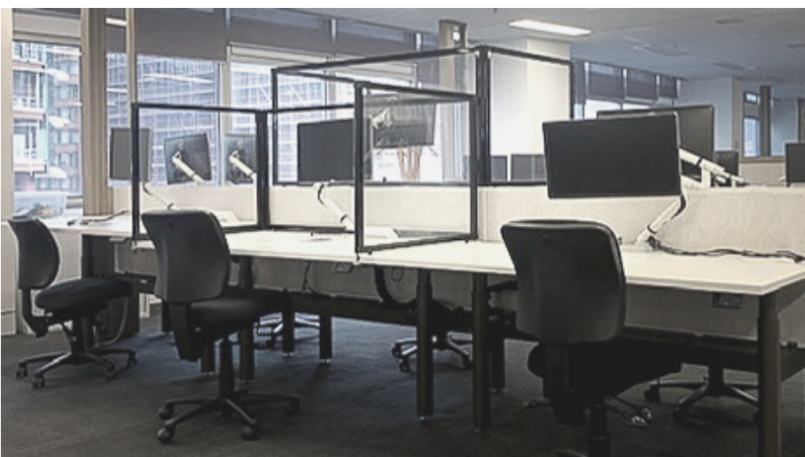
AMP Financial Services Firm trials back to back PPA screens - Sydney Office

The process has been adopted by Cushman & Wakefield, AMP and a well known global law firm.